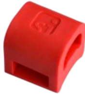
Mounting holder "Bike" for SIAC

SPORTident offers mounting equipment both for MTBO and Ski-O.