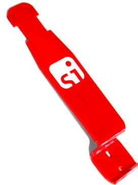
Mounting holder "SkiO" for SIAC

SPORTident AIR+ mode can be compromised by disturbances caused by third party equipment. The active antenna of some GPS-watches can significantly reduce the SIAC's sensitivity. As a general rule a GPS-watch and SIAC shall not be carried on the same arm.